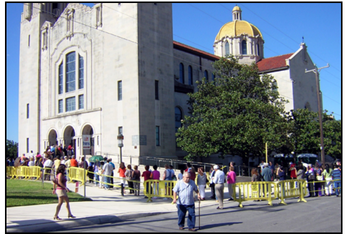
The San Antonio faithful waited for hours to venerate the relic.