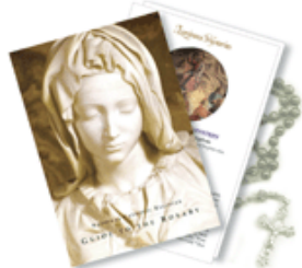
A Guide to the Rosary