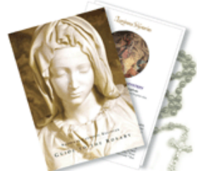
A Guide to the Rosary